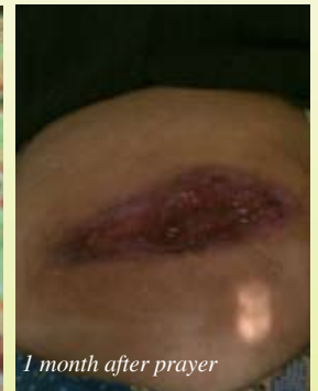
1 month after prayer