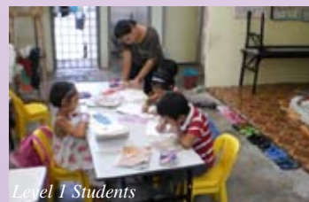
Level 1 Students

Many more families are in similar conditions requiring financial aid. Myanmar Migrant Learning Centre (MMLC) in Kepong Maluri, is a school set up by FRO to provide some form of education to their children. The Foodbank provides milk and biscuits to the school. MMLC is looking for sponsors to provide lunch to the children. They have 30 students and expects to increase the numbers to 50. They are looking for sponsors to provide the children with lunch. A nursery for 2 to 5 years old was set up recently in August 2010 in Taman Miharja. The purpose of which is to free the mothers to look for gainful employment. The Foodbank is also supplying milk and biscuits to this nursery. This nursery is also looking for sponsors to provide lunches. They commenced operation on 2 nd August 2010 with 20 children. They are expecting a rapid increase in clientele to 50 children.