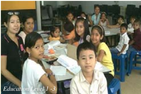
Education Level 1 -3