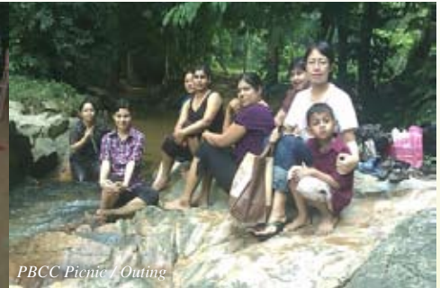
PBCC Picnic / Outing

A Ministry cannot be complete with no miracles and healings. On one occasion, a Myanmar women came for prayers. Her husband had been scolding her daily and wants to send her back to Myanmar. After prayers, her husband had not scolded her since.