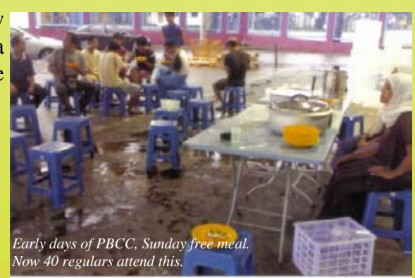
Early days of PBCC, Sunday free meal. Now 40 regulars attend this.