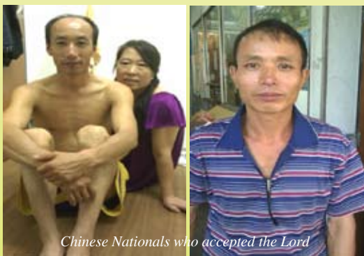
Chinese Nationals who accepted the Lord

So far PBCC has seen 24 salvations. 14 of these were Indian nationals who were cheated by the agents, finding no jobs or accommodation on arrival from India. They were staying in Batu Caves but had no money and passport. CREST and Tenaganita referred them to PBCC and food was provided to them. 3 salvations were from Chinese nationals and the rest Myanmaris.