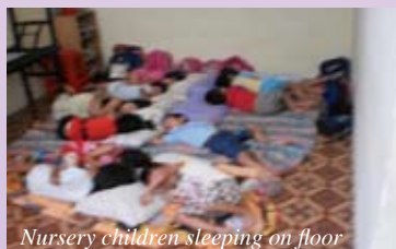
Nursery children sleeping on floor